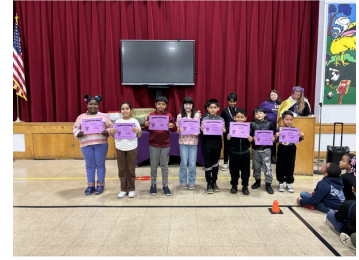
Specials and EL Students of the Month