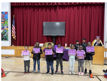
First Grade Students of the Month