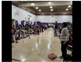
Students had to throw pom-poms in a cup and fill it up!