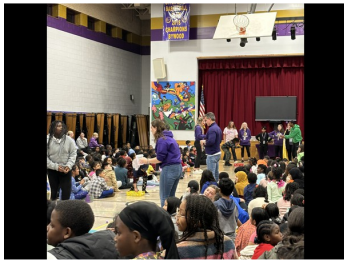
No Assembly is complete without our Minute to Win it Game!