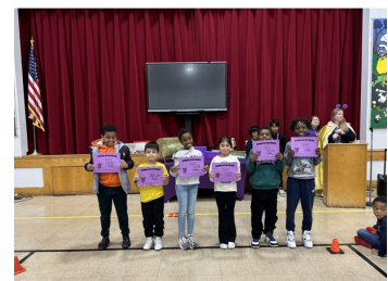
Third Grade Students of the Month