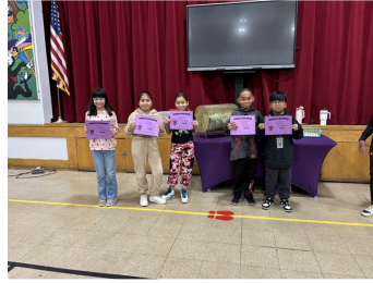
Fifth Grade Students of the Month