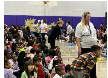
Everyone had so much fun!