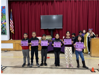
Fourth Grade Students of the Month