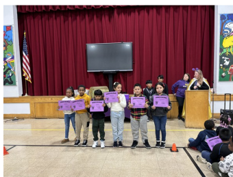
Second Grade Students of the Month